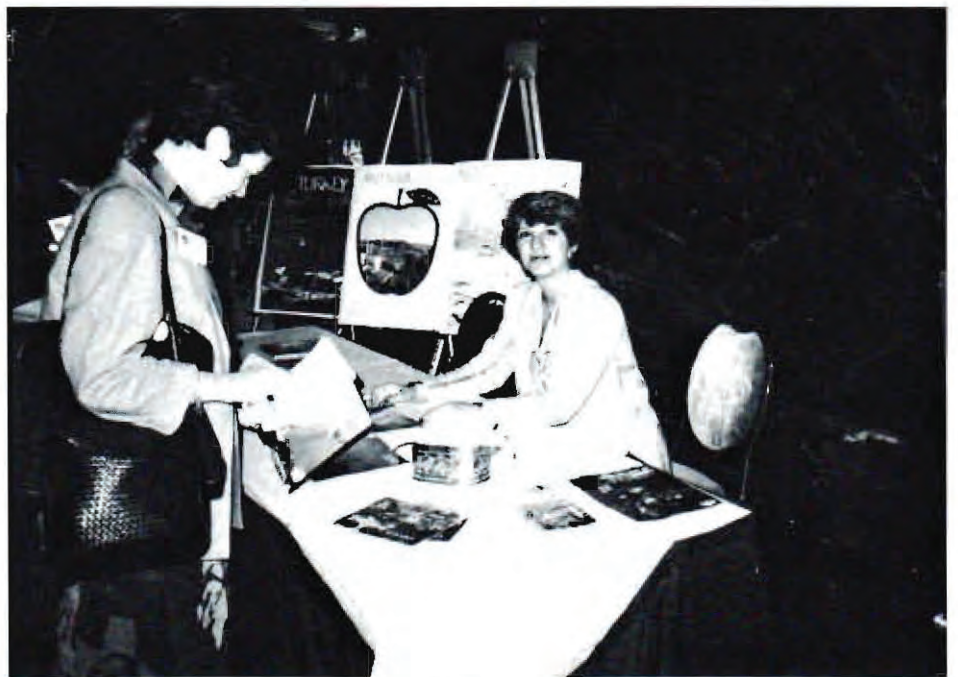
Delegates gather tourism information about Turkey from the 1986 Washington Convention.