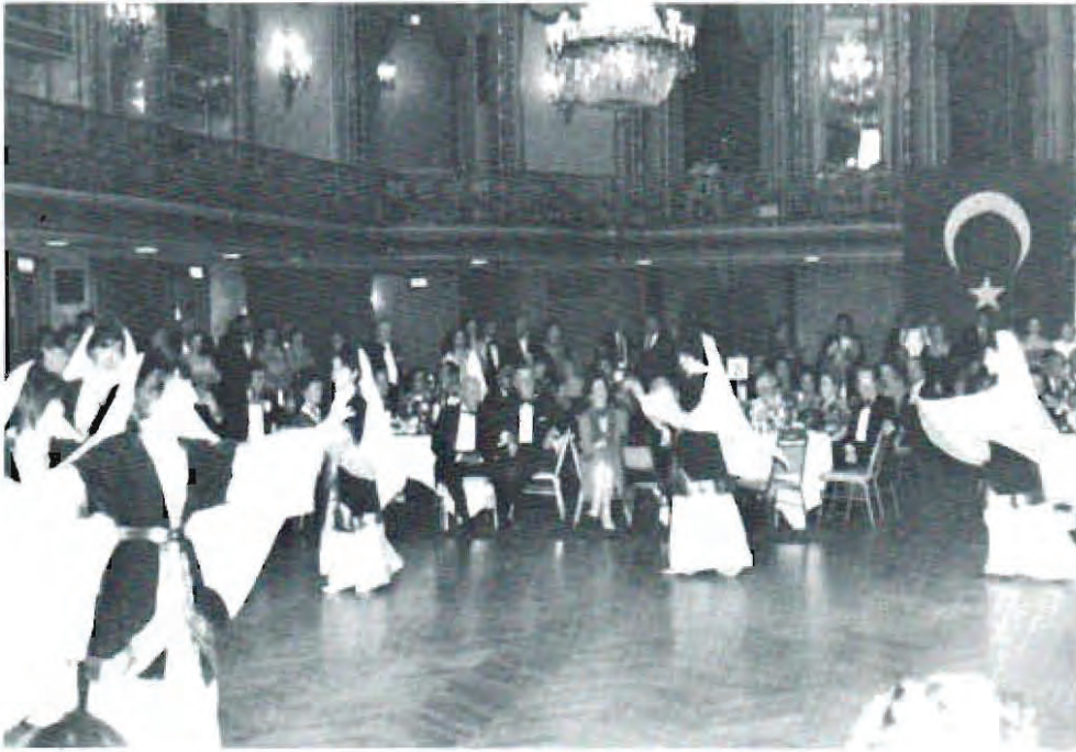
Turkish dancers delight the audience at the Chicago Convention.