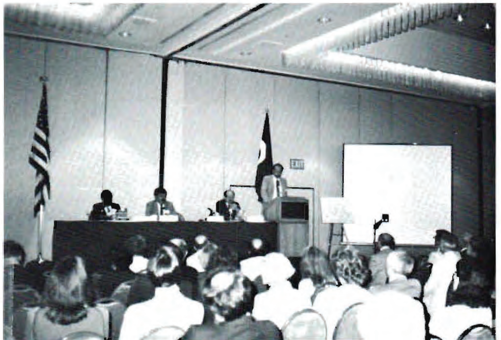
Ottoman History is featured at the Ninth Convention in Washington, D.C., May 8-10, 1987.