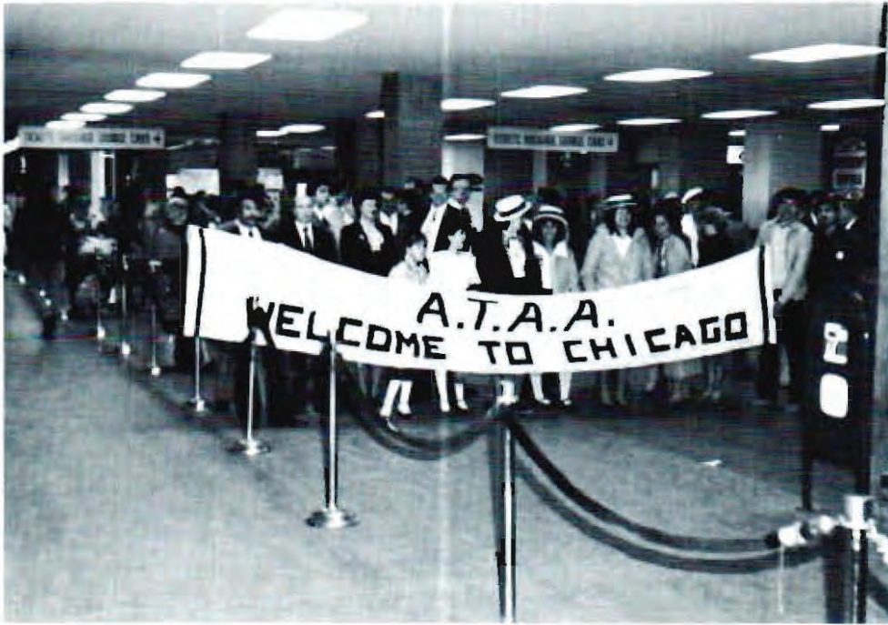
Arrivals from the "Turkish Express" train are welcomed to Chicago for the fourth Convention, April 17-18, 1982.