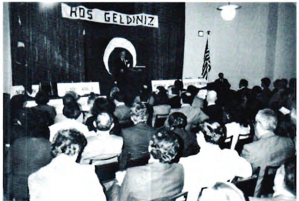
Conventioners listen to issues affecting the community at the fifth Convention in Atlanta, Georgia, April 15-17, 1983.