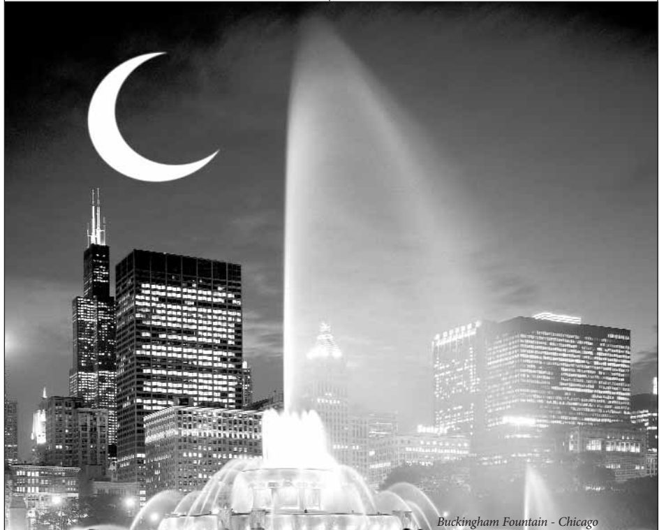
Buckingham Fountain - Chicago