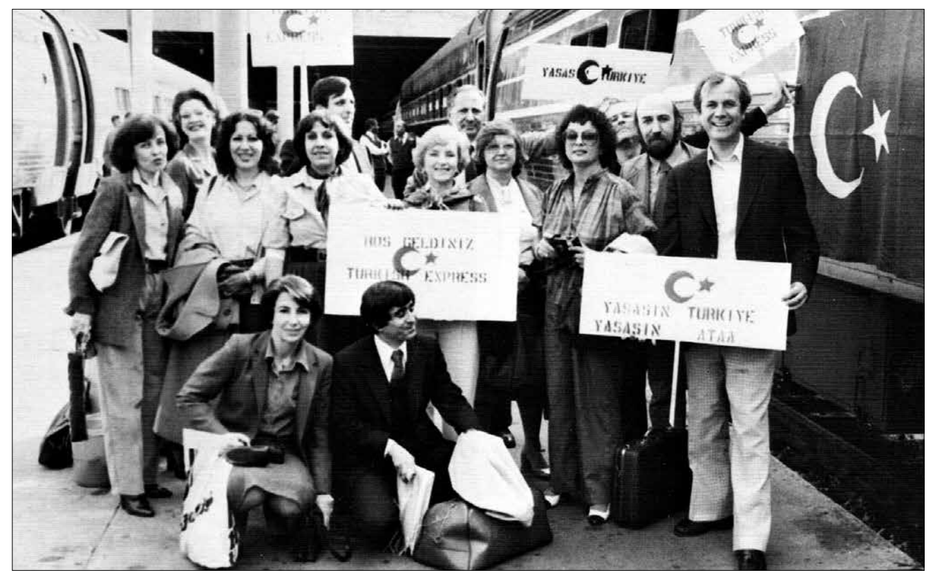
Turkish Express, ATAA Annual Convention 1982